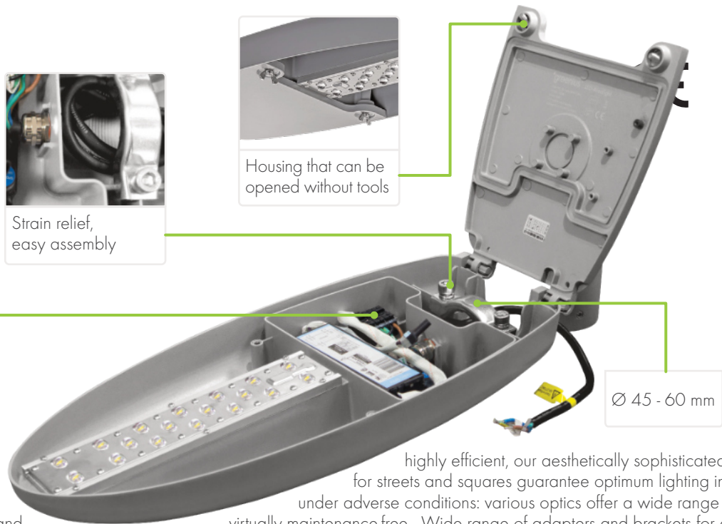
Ø 45 - 60 mm

Technically sophisticated and robust LED lighting solutions compliance with standards, even applications. Extremely durable and variety of installation projects.