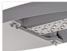
Housing that can be opened without tools